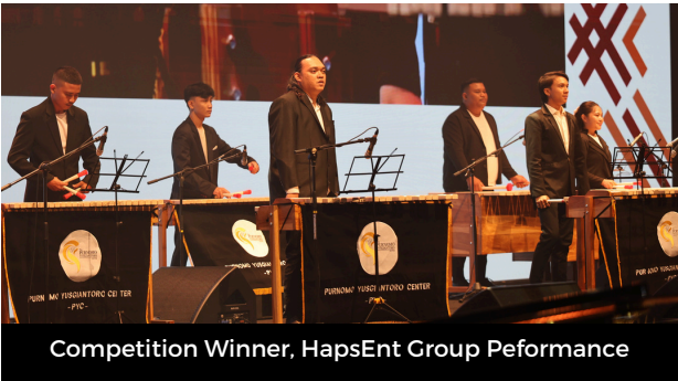
Competition Winner, HapsEnt Group Performance